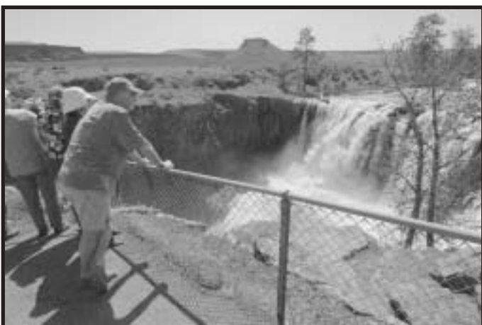
White River Falls Park

Upon crossing Sherars Bridge over the Deschutes river, we stopped for an afternoon break at White River Park. This little park is a lush spot in the high plans. The river supported a couple of past dams for milling grain and generating