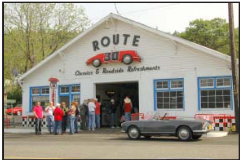
Route 30 Cafe, Moiser

Lunch was picnic style at Maryhill Park. First time I have ever been at that park and had sun, but no wind. Usually, you get one or the other. The windsurfers and kite boarders