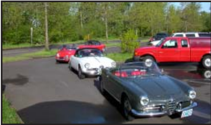
Leaving Lewis & Clark Park

With over 25 Alfas and close to 50 people, perfect weather and great roads, AROOs 2006 Old Spider Tour was a another success. We were wondering what the weather might be. Early in the week, it was WET and not looking good. By Friday, a high pressure set in and we enjoyed some of the best car touring April weather I can remember.