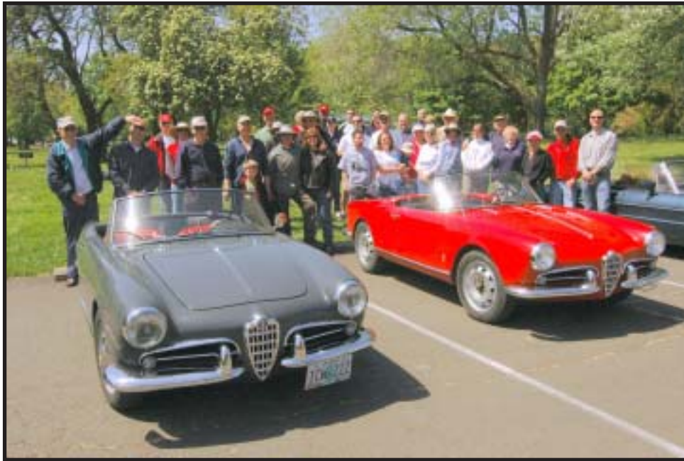
Our group at lunch, over 25 cars!