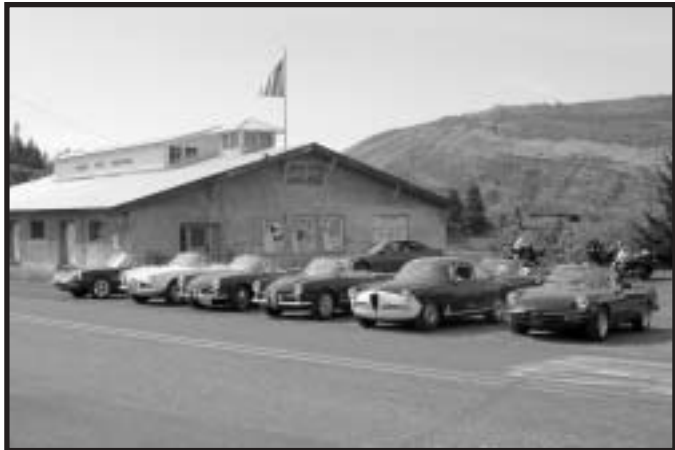
End of Tour, Mosier

power, but is now free flowing and a sight to see. The group was relaxed and enjoying the